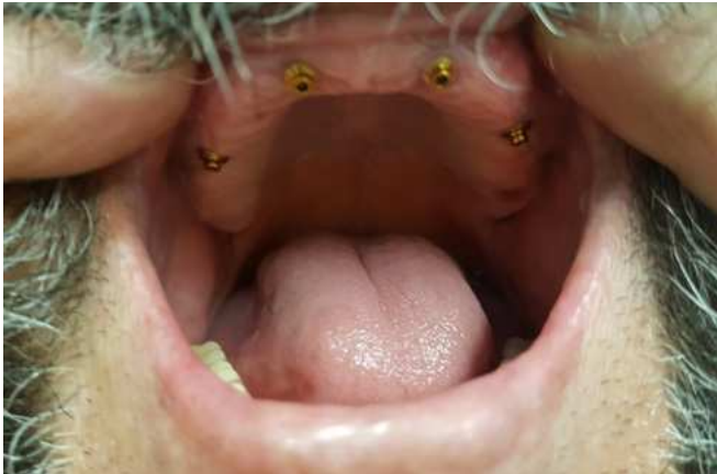
Upper implant supported over-denture